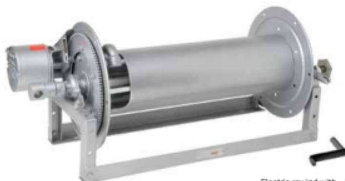
Electric rewind with gear-driven crank rewind and optional finish shown