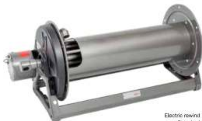
Electric rewind Standard configuration shown