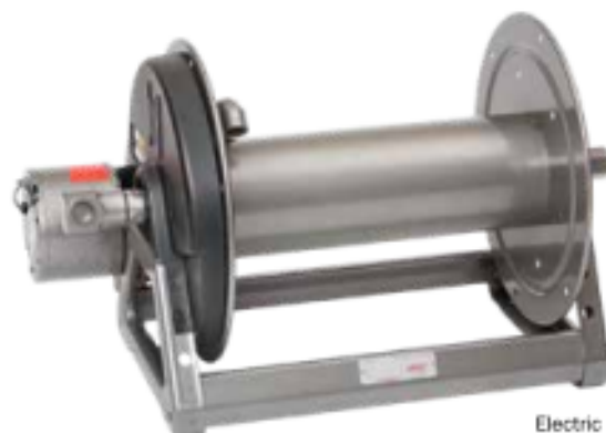
Electric rewind Standard configuration shown